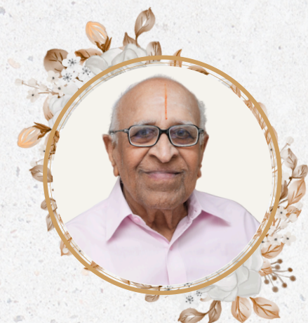
Chief Patron, Mentor, and Guiding Light of eVidyaloka